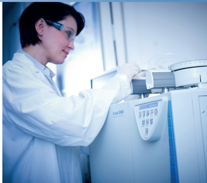
Figure 1. FLASH 2000 Analyzer