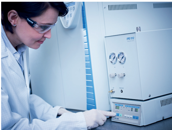
Figure 2. FPD Detector

The Thermo Scientific™ FLASH 2000 CHNS analyzer (Figure 1), which is based on the dynamic combustion of the sample, allows quantitative determination of carbon, nitrogen, hydrogen and sulfur in a single run. The system copes effortlessly with the wide array of modern laboratory requirements such as accuracy, reproducibility and low cost per analysis.